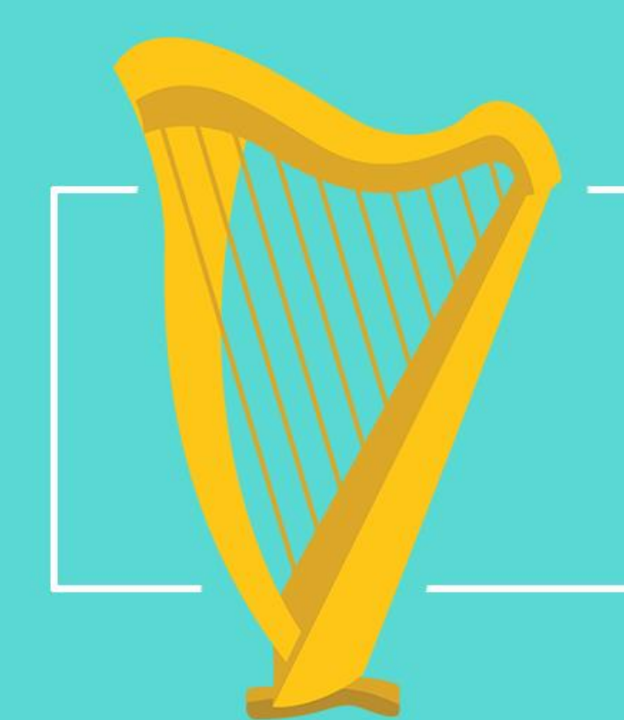
Exhibit #1 HIS IMPECCABLE SENSE OF JUSTICE