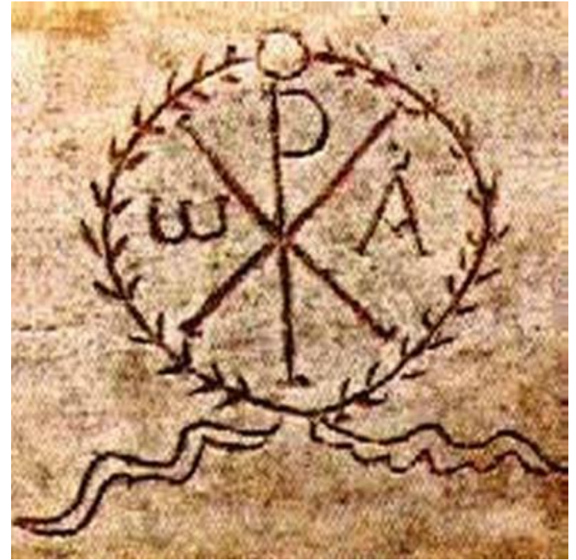
Ancient Christian imagery: angel, the Good Shepherd, and the Chi-Rho