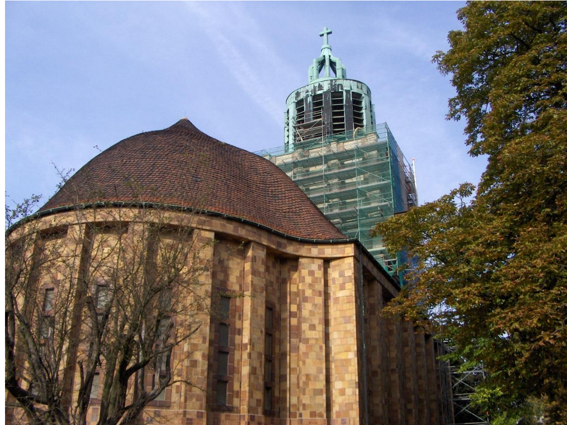
Martin Luther Memorial Church, Berlin