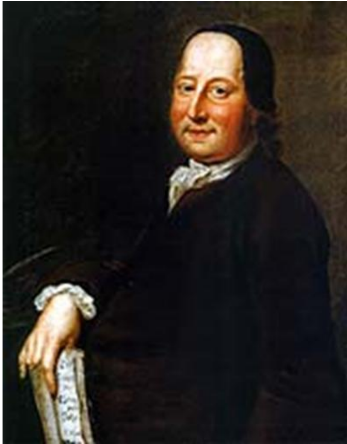
Nikolaus Ludwig Count von Zinzendorf (1700-1769) and Herrnhut (below)